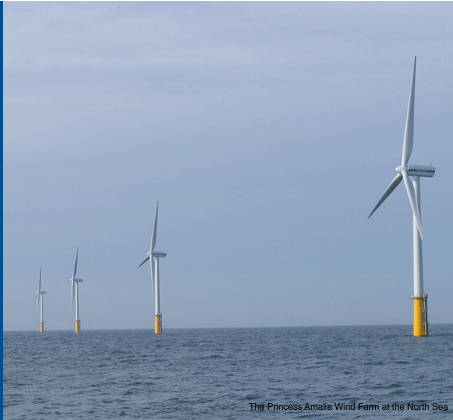
The Princess Amalia Wind Farm at the North Sea

DOWES is a 4 year R&D project, it started in March 2009 and will stretch until the end of 2013.